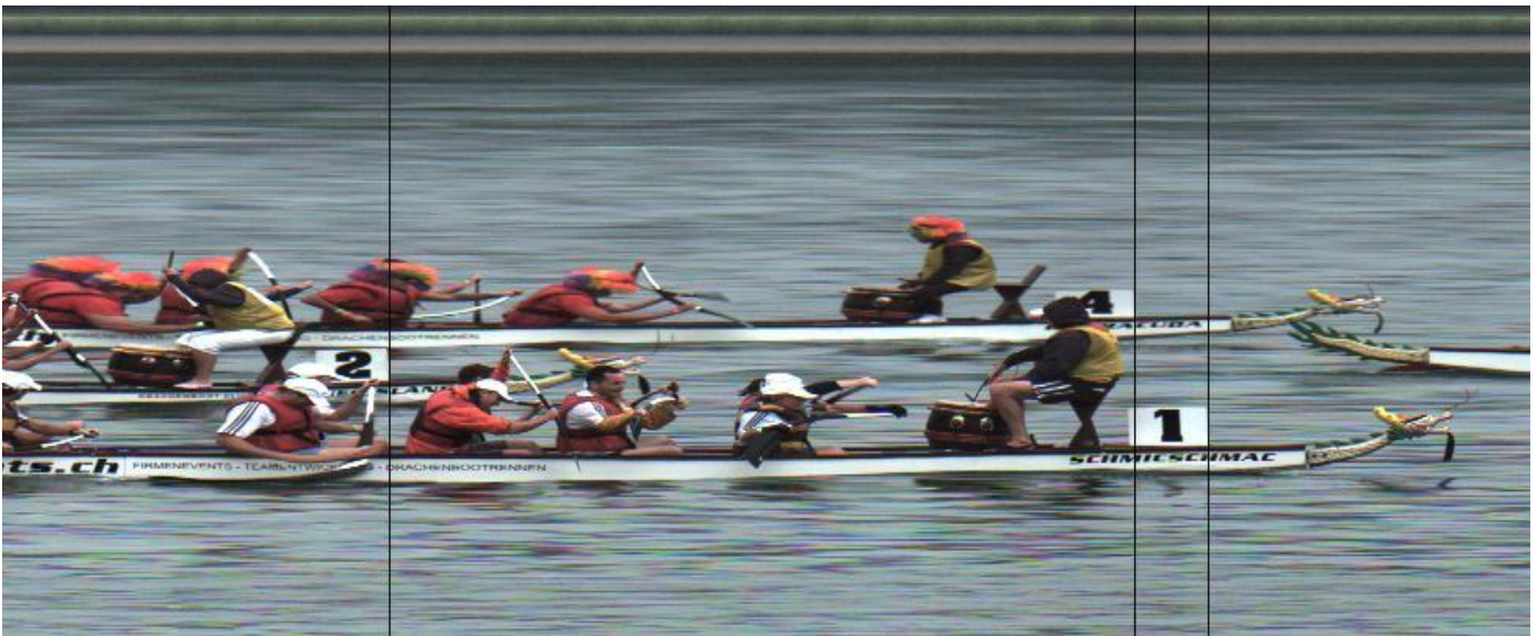
Race Nr 21, smallest Gap between 2 nd and 3 rd : 0.097 sec.